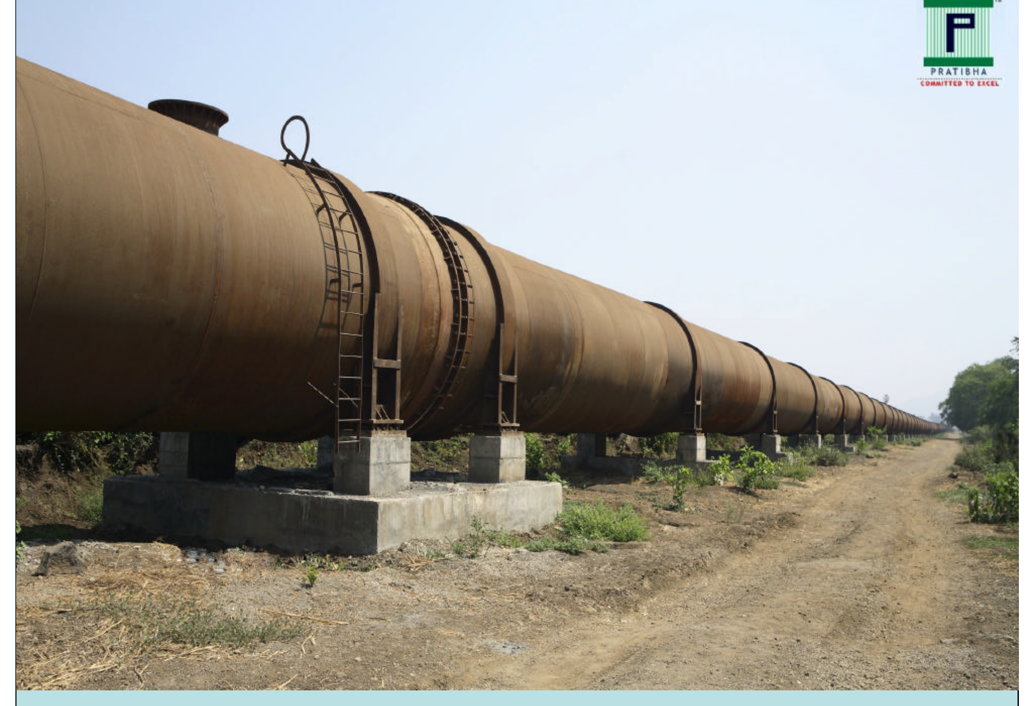
PIPELINE (Before Painting)