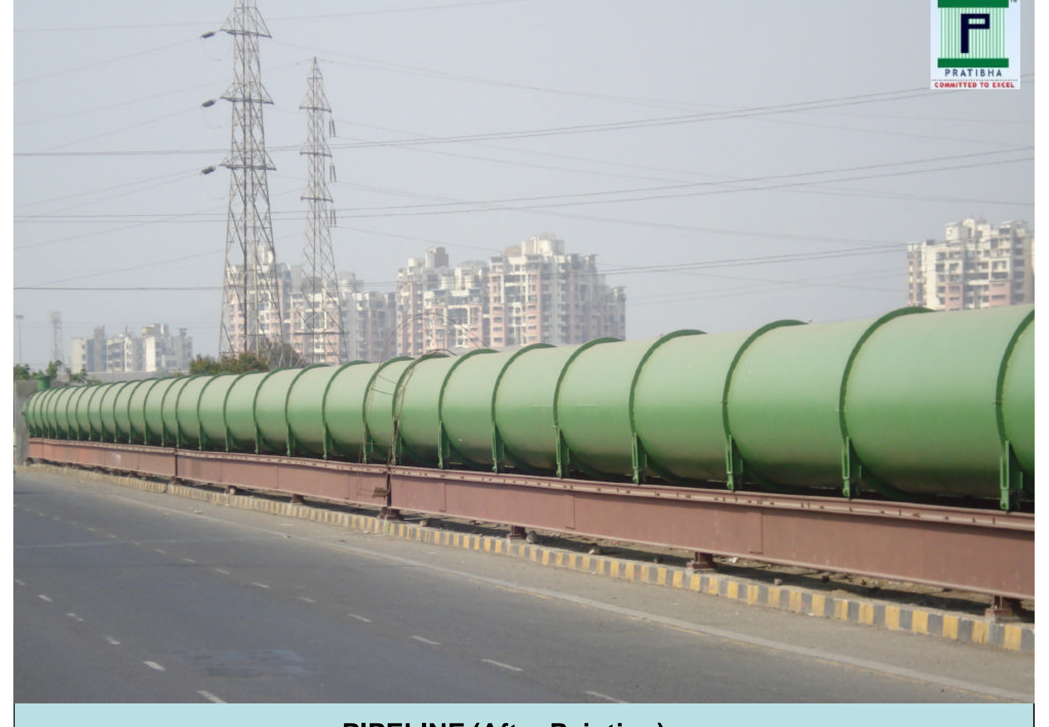
PIPELINE (After Painting)