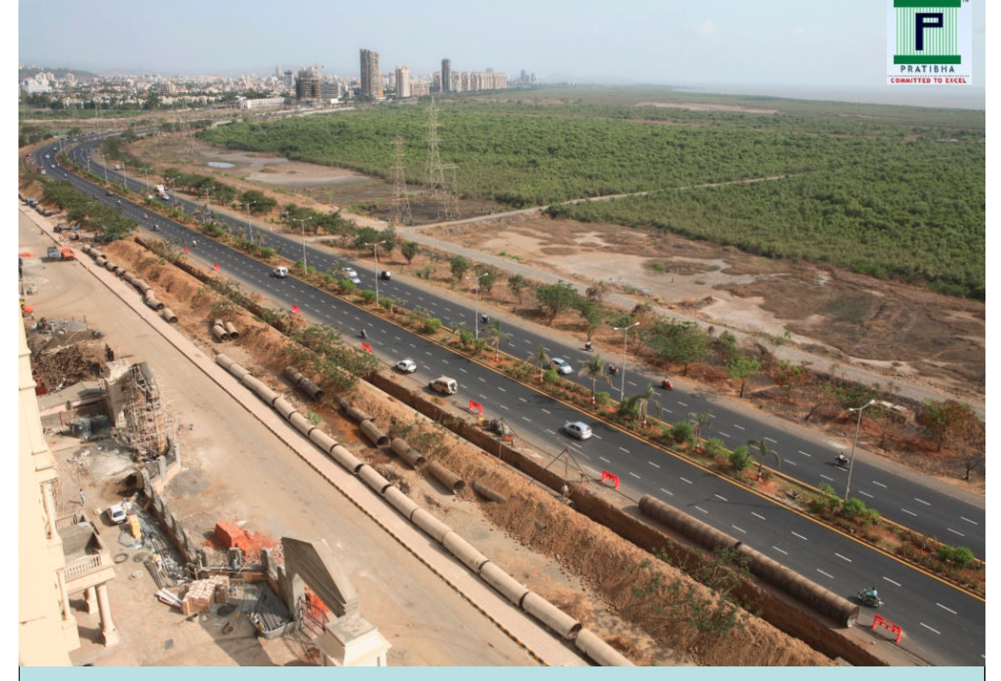
NMMC SITE-Dipe Route