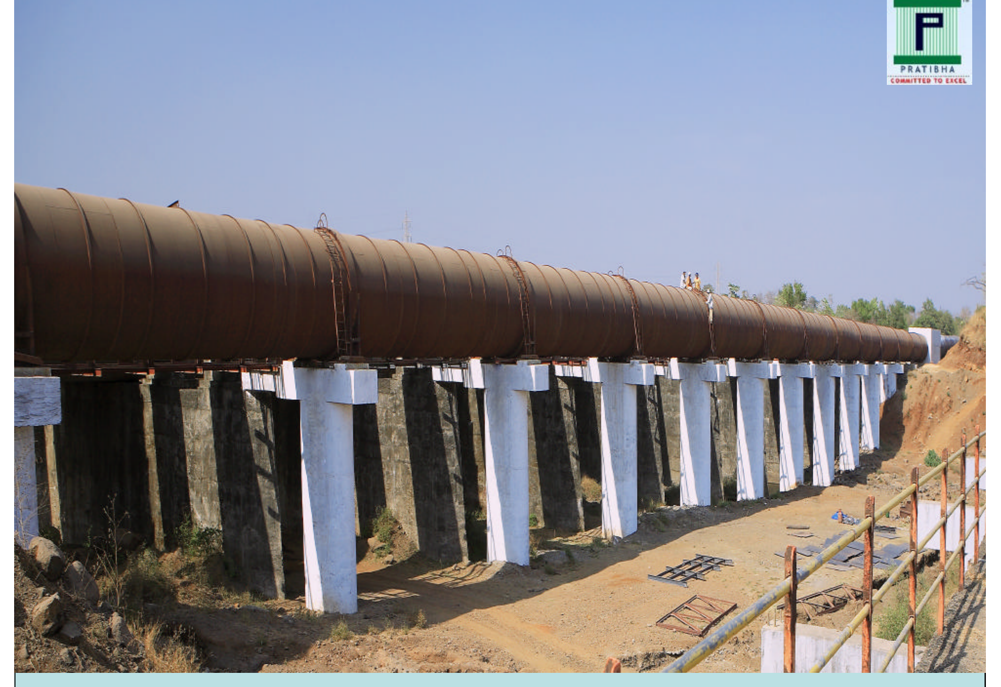
COMPLETED PIPELINE – ABOVE GROUND LEVEL