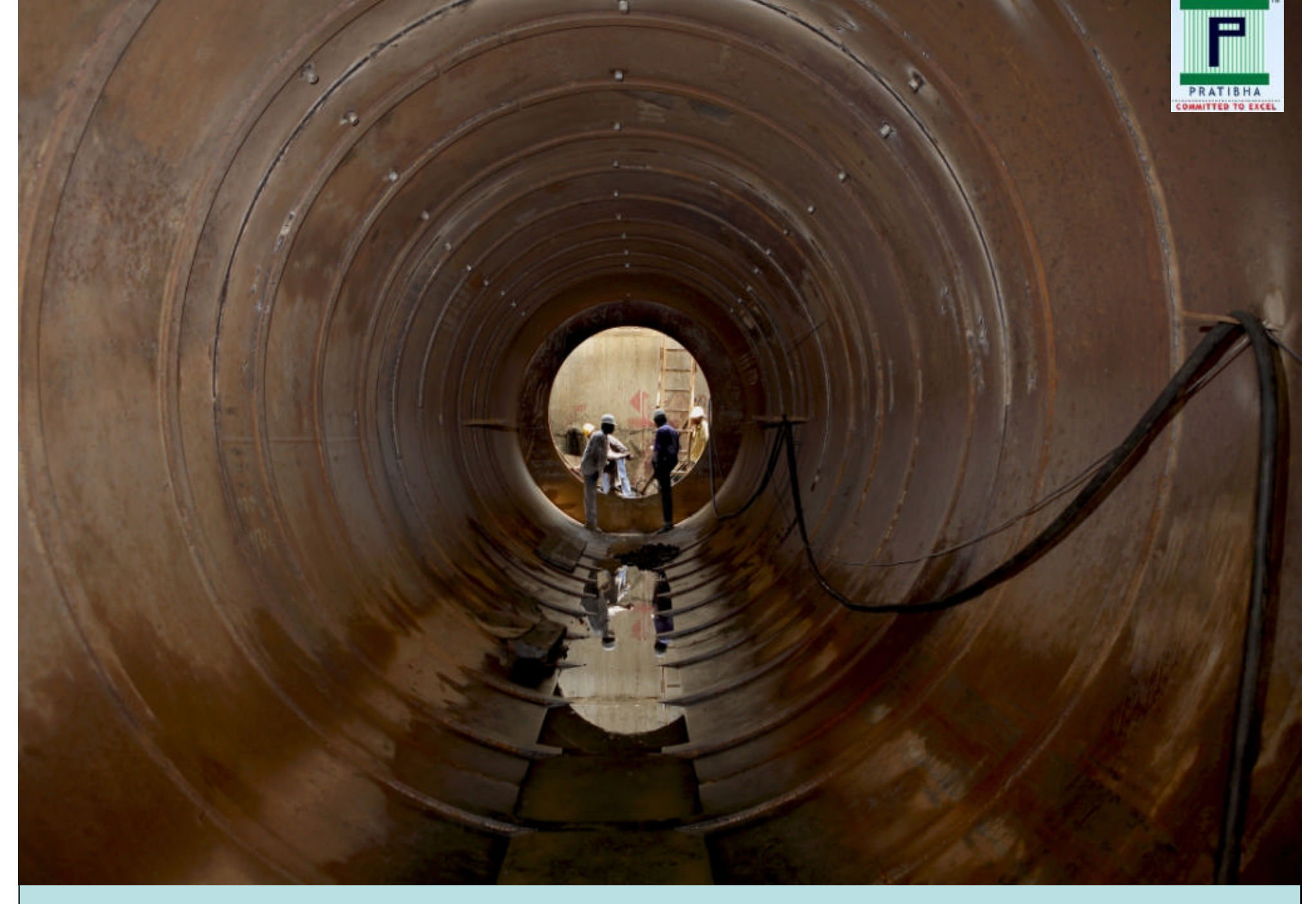
INTERNAL VIEW OF A PIPE